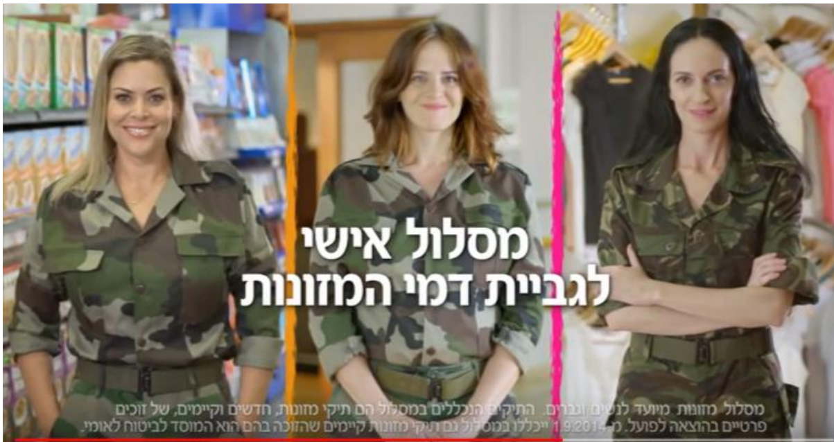
112. This is a visual proof that the Israeli Defendants declared a war on the Jewish men of Israel. However explicit admissions in writing and in English can be